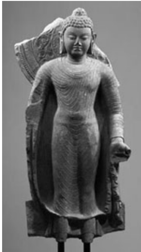
Buddha Standing , Gupta period (ca. 319?-500), 5th century, Uttar Pradesh, Mathura, India, Metropolitan Museum of Art