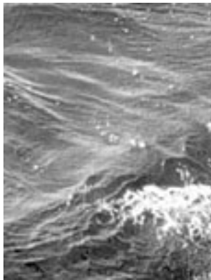
Eddies (detail), NOAA