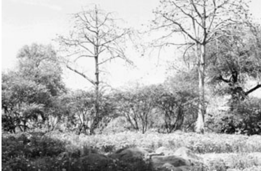
Jayanti Park

divinity's way and purpose, to be here yellow, here blue, there sky, there forest, and here Siddhartha. The purpose and the essential properties were not somewhere behind the things, they were in them, in everything.