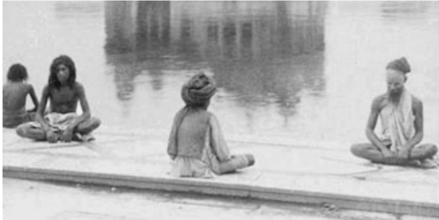
Fakirs at Amritsar