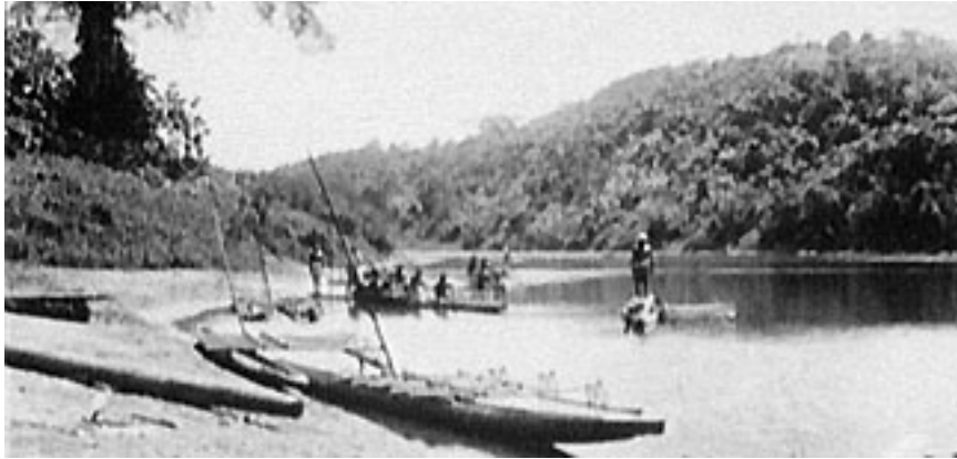
River Scene, Library of Congress