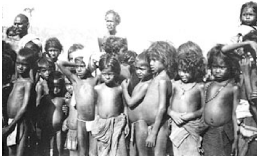
Children, Madras

“Surely. This too, I have learned from the river: everything is coming back! You too, Samana , will come back. Now farewell! Let your friendship be my reward. Commemorate me, when you’ll make offerings to the gods.”