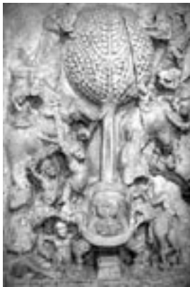
Assault of Mara