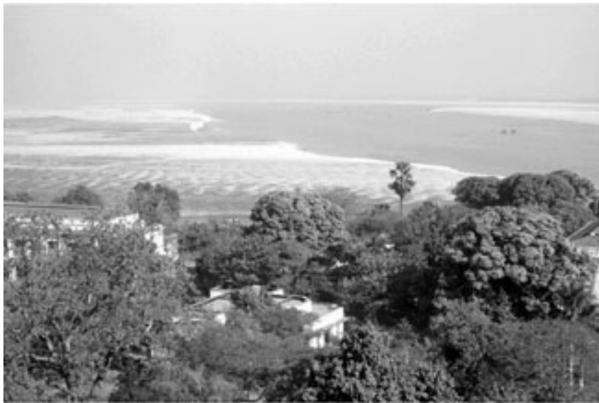
The Banks of the Ganges near Patna

With a bright smile, he left; Siddhartha watched him leaving. With deep joy, with deep solemnity he watched him leave, saw his steps full of peace, saw his head full of lustre, saw his body full of light.