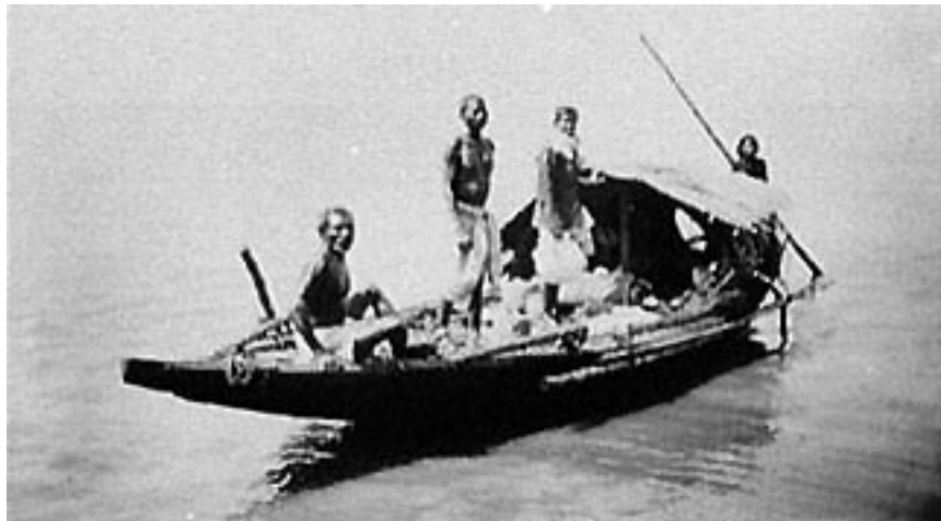
Bamboo Boat

learned to build an oar, and learned to mend the boat, and to weave baskets, and was joyful because of everything he learned, and the days and months passed quickly. But more than Vasudeva could teach him, he was taught by the river. Incessantly, he learned from it. Most of all, he learned from it to listen, to pay close attention with a quiet heart, with a waiting, opened soul, without passion, without a wish, without judgement, without an opinion.