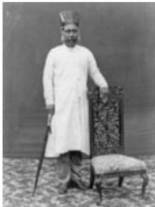
Official, Library of Congress