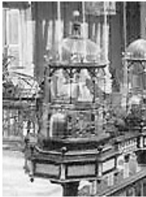
Bird Cage Library of Congress (detail)