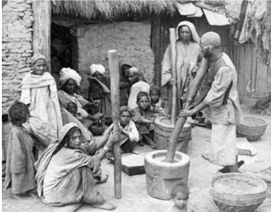
Shelling Rice and Gossiping with the Neighbors

Kamaswami followed the advice. But Siddhartha cared little about this. When he made a profit, he accepted it with equanimity; when he made losses, he laughed and said: “Well, look at this, so this one turned out badly!”