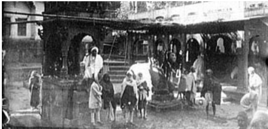
Well of Knowledge, Library of Congress

I am deprived by the Buddha, thought Siddhartha, I am deprived, and even more he has given to me. He has deprived me of my friend, the one who had believed in me and now believes in him, who had been my shadow and is now Gotama’s shadow. But he has given me Siddhartha, myself.