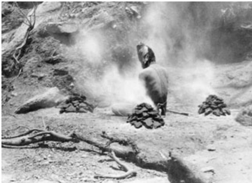
Hermit at Gem Lake

Silently, Siddhartha exposed himself to burning rays of the sun directly above, glowing with pain, glowing with thirst, and stood there, until he neither felt any pain nor thirst any more. Silently, he stood there in the rainy season, from his hair the water was dripping over freezing shoulders, over freezing hips and legs, and the penitent stood there, until he could not feel the cold in his shoulders and legs any more, until they were silent, until they were quiet. Silently, he covered in the thorny bushes, blood dripped from the burning skin, from festering wounds dripped pus, and Siddhartha stayed rigidly, stayed motionless, until no blood flowed any more, until nothing stung any more, until nothing burned any more.