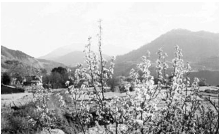
Spring in Bhimtal

Siddhartha bent down, picked up a stone from the ground, and weighed it in his hand.