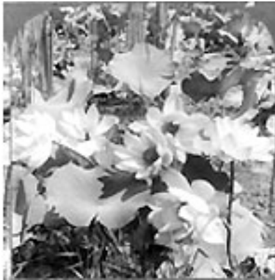
India's Sacred Lotus , Library of Congress