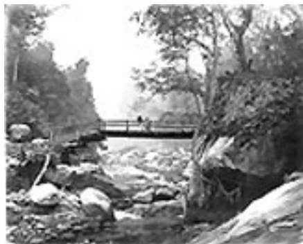
Bridge over the Rungroo, Darjeeling, India

He thought these thoughts, listened with a smile to his stomach, listened gratefully to a buzzing bee. Cheerfully, he looked into the rushing river, never before he had liked a water so well as this one, never before he had perceived the voice and the parable of the moving water thus strongly and beautifully. It seemed to him, as if the river had something special to tell him, something he did not know yet, which was still awaiting him. In this river, Siddhartha had intended to drown himself, in it the old, tired, desperate Siddhartha had drowned today. But the new Siddhartha felt a deep love for this rushing water, and decided for himself, not to leave it very soon.