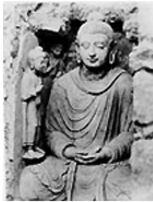
Meditative Buddha