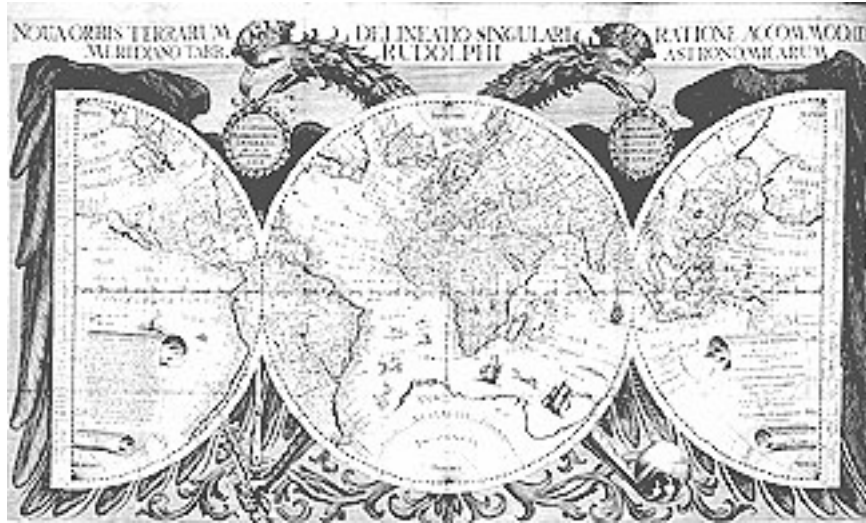
Tabulae Rudolphinae : quibus astronomicae.. by Johannes Kepler, 1571-1630