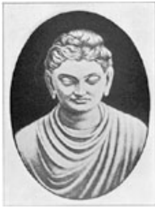
Buddha , Antiquities Project