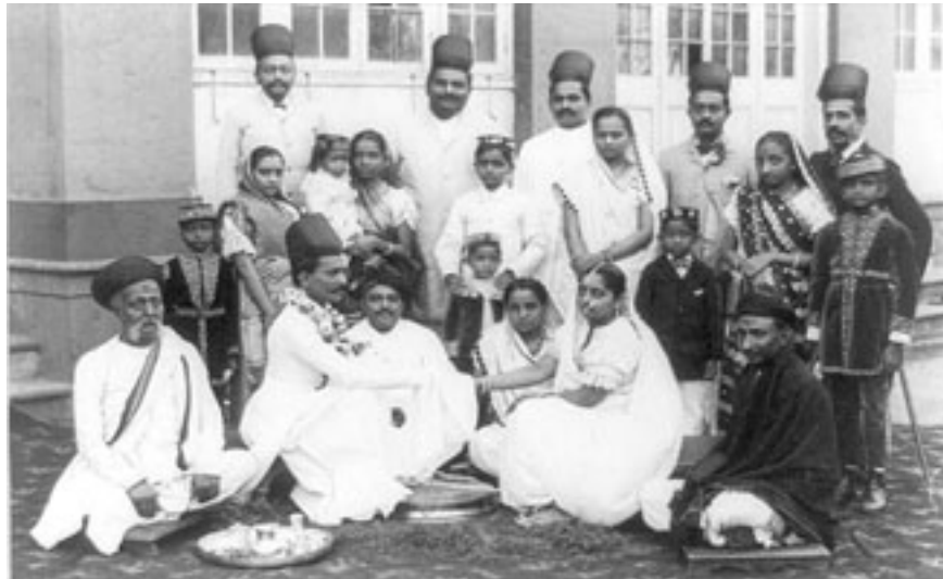
Parsee Wedding, India

much a basket of fish costs and how much interests may be charged on loaned money. These are your areas of expertise. I haven't learned to think from you, my dear Kamaswami, you ought to be the one seeking to learn from me."