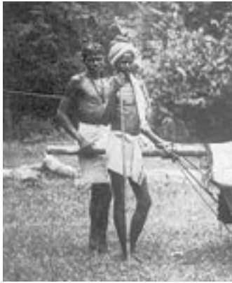
Two Figures, Library of Congress