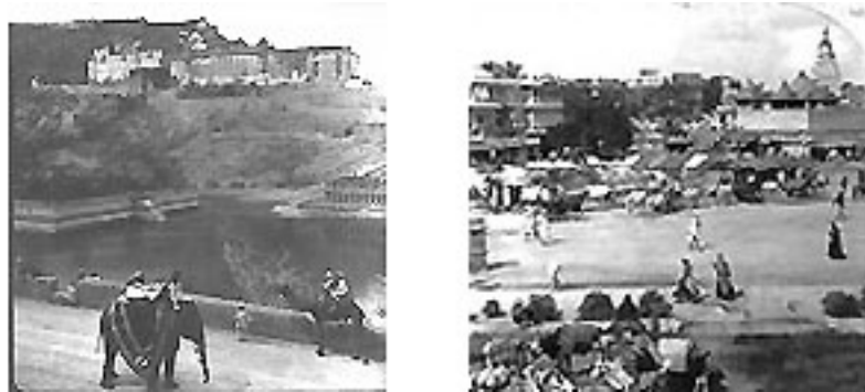
Amber Palace and Square

ness, was full of peace. Gotama taught the teachings of suffering, of the origin of suffering, of the way to relieve suffering. Calmly and clearly his quiet speech flowed on. Suffering was life, full of suffering was the world, but salvation from suffering had been found: salvation was obtained by him who would walk the path of the Buddha. With a soft, yet firm voice the exalted one spoke, taught the four main doctrines, taught the eightfold path, patiently he went the usual path of the teachings, of the examples, of the repetitions, brightly and quietly his voice hovered over the listeners, like a light, like a starry sky.