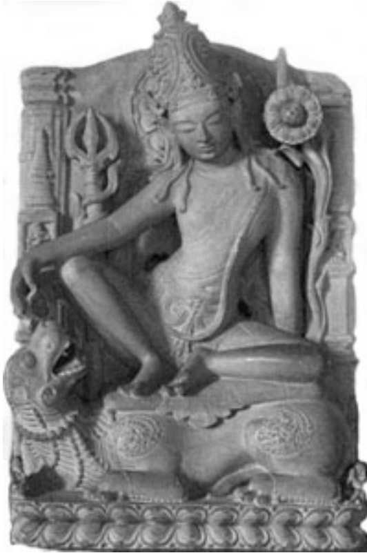
Discovering the Unseen (or lesser known) Heritage, Image-India, ©Shishir Thadani