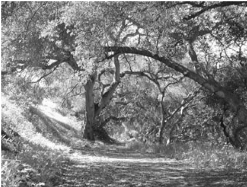
Country Scene, Antiquities Project

Out of this moment, when the world melted away all around him, when he stood alone like a star in the sky, out of this moment of a cold and despair, Siddhartha emerged, more a self than before, more firmly concentrated. He felt: This had been the last tremor of the awakening, the last struggle of this birth. And it was not long until he walked again in long strides, started to proceed swiftly and impatiently, heading no longer for home, no longer to his father, no longer back.