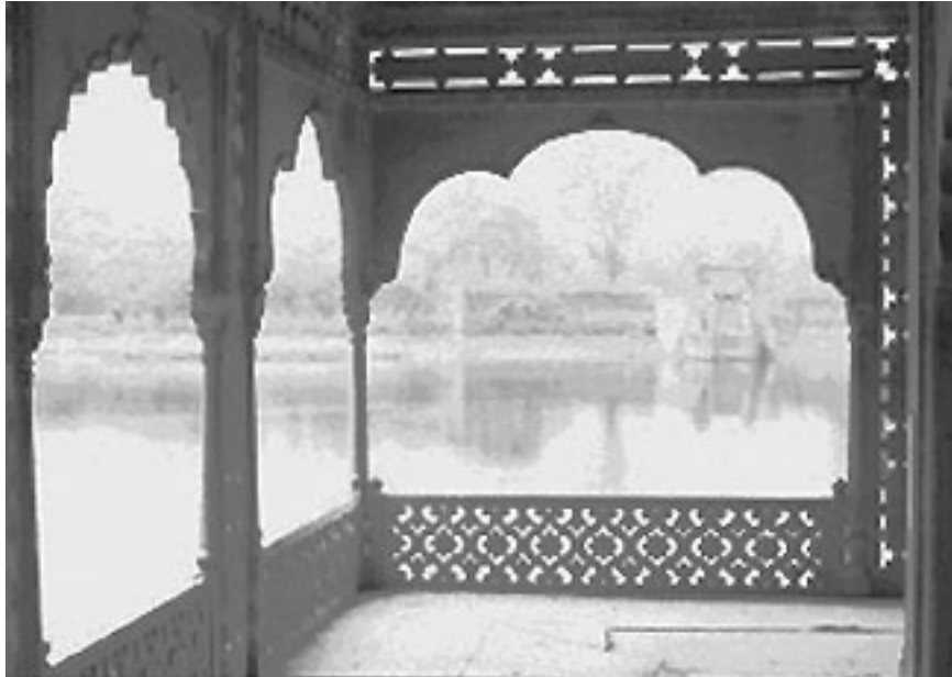
At Monsoon Palace, Deeg, Rajasthan