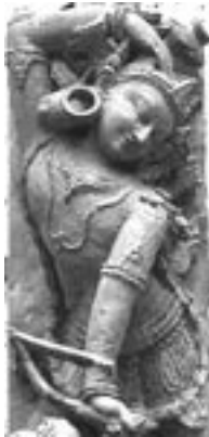
Kama: God of Love