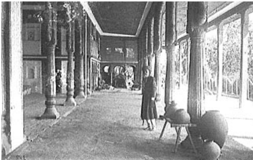
Hyderabad Colonnade

When she received the first news of Siddhartha's disappearance, she went to the window, where she held a rare singing bird captive in a golden cage. She opened the door of the cage, took the bird out and let it fly. For a long time, she gazed after it, the flying bird. From this day on, she received no more visitors and kept her house locked. But after some time, she became aware that she was pregnant from the last time she was together with Siddhartha.