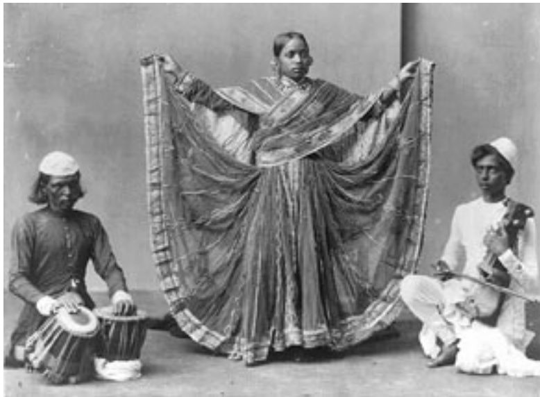
Dancing Girl

"It might very well be so," Siddhartha said tiredly. "I am like you. You also do not love—how else could you practise love as a craft? Perhaps, people of our kind can't love. The childlike people can; that's their secret."