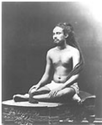
Priest Sitting