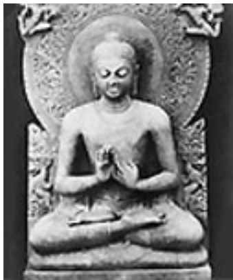
Buddha Preaching